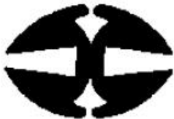
P 6.4mm, G 6.4mm W19 1438