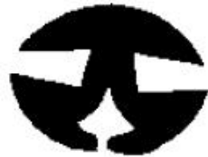
P 6.4mm, G 6.4mm W8 1431