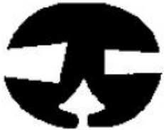
P 4.8mm, G 9.5mm W7 1432