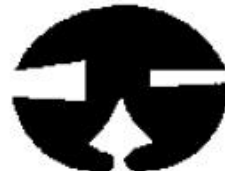
P 1.6mm, G 6.4mm W4 1435