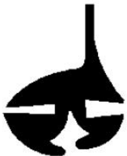
P 3.2, G 4.8 CARAVAN W2035