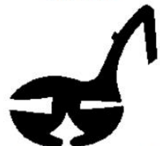
P 3.2, G 4.8 CARAVAN W5028