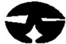
P 1.6mm, G 4.8mm W17 1440