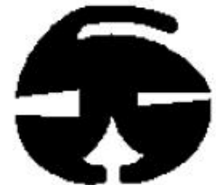
P 1.6mm, G 4.8mm W6 1433