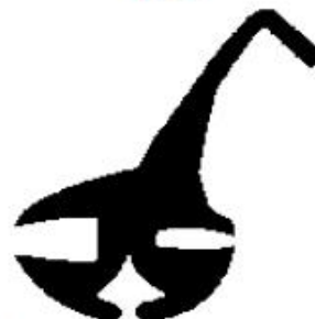
P 1.6mm, G 6.4mm W43 CARAVAN 1444