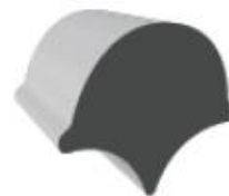
FILLER STRIP MED WHITE (30m Roll) 1456