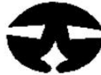
P 4.8mm, G 4.8mm W9 1430