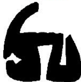
UNIVERSAL W42 1436