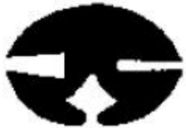
P 1.6mm, G 4.8mm W2 1369

Made of natural rubber with a shore hardness of 65-69 and a resistance to temperatures up to 85°C. They are sold by the metre or as a coil which has a standard length of 15m. Pictures are indicative only and not to scale.