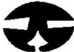
P 3.2mm, G 6.4mm W3 1443