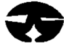
P 1.6mm, G 4.8mm W17 1440