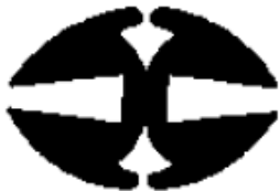
P 6.4mm, G 6.4mm W19 1438