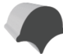
FILLER STRIP MED WHITE (30m Roll) 1456