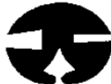
P 1.6mm, G 6.4mm W4 1435