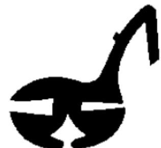
P 3.2, G 4.8 CARAVAN W5028