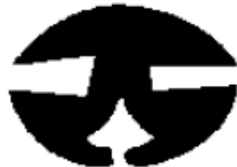
P 3.2mm, G 6.4mm W3 1443