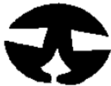
P 6.4mm, G 6.4mm W8 1431