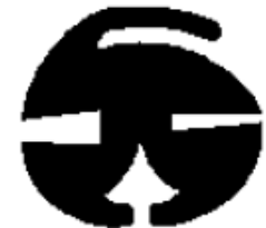
P 1.6mm, G 4.8mm W6 1433