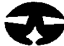
P 4.8mm, G 4.8mm W9 1430