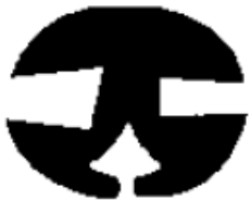
P 4.8mm, G 9.5mm W7 1432