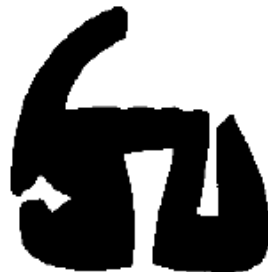
UNIVERSAL W42 1436