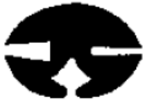
P 1.6mm, G 4.8mm W2 1369

Made of natural rubber with a shore hardness of 65-69 and a resistance to temperatures up to 85°C. They are sold by the metre or as a coil which has a standard length of 15m. Pictures are indicative only and not to scale.