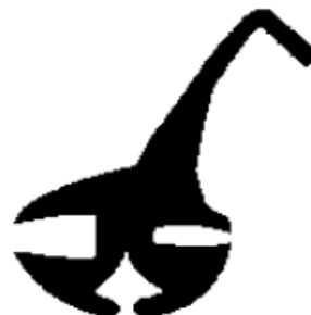
P 1.6mm, G 6.4mm W43 CARAVAN 1444