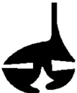
P 3.2, G 4.8 CARAVAN W2035